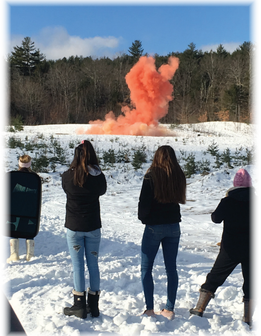
It's a girl

So on the given day family starts arriving at the gravel pit. Being in Hill, NH at somewhat an elevation, there is a good deal of snow on the ground so 4-wheel drive is required. When I finally arrive there are about 25 vehicles, a ripping bonfire of discarded pallets and logs ablaze, a commercial size gas skillet cooking burgers and dogs for the crowd, and in the distance, up one of the gravel slopes, is Frosty the Snowman made of fresh snow from the night before and standing 6-foot tall, with a corn cob pipe, top hat, and two eyes made out of coal. Before too much partying transpires my son has my $3000.00 custom made 7.62 sniper rifle set up on its tripod on the roof of his pickup truck. And there is Frosty about 200 yards away smiling ear to ear- oblivious. My son tells the gathered family to look downrange at Frosty and he touches off a round at Frosty's top hat, or what is hiding beneath it. ●